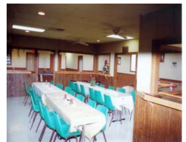
Inside seating for 100

For rental rates and availability, please call Greg at 740-922-0334- tell him the Twin City Chamber sent you!